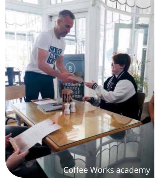
Coffee Works academy

This funding is at a record level, acknowledging the part Kingdom Works plays to reduce employment inequalities in Fife, contributing to lowering unemployment rates and addressing poverty levels.