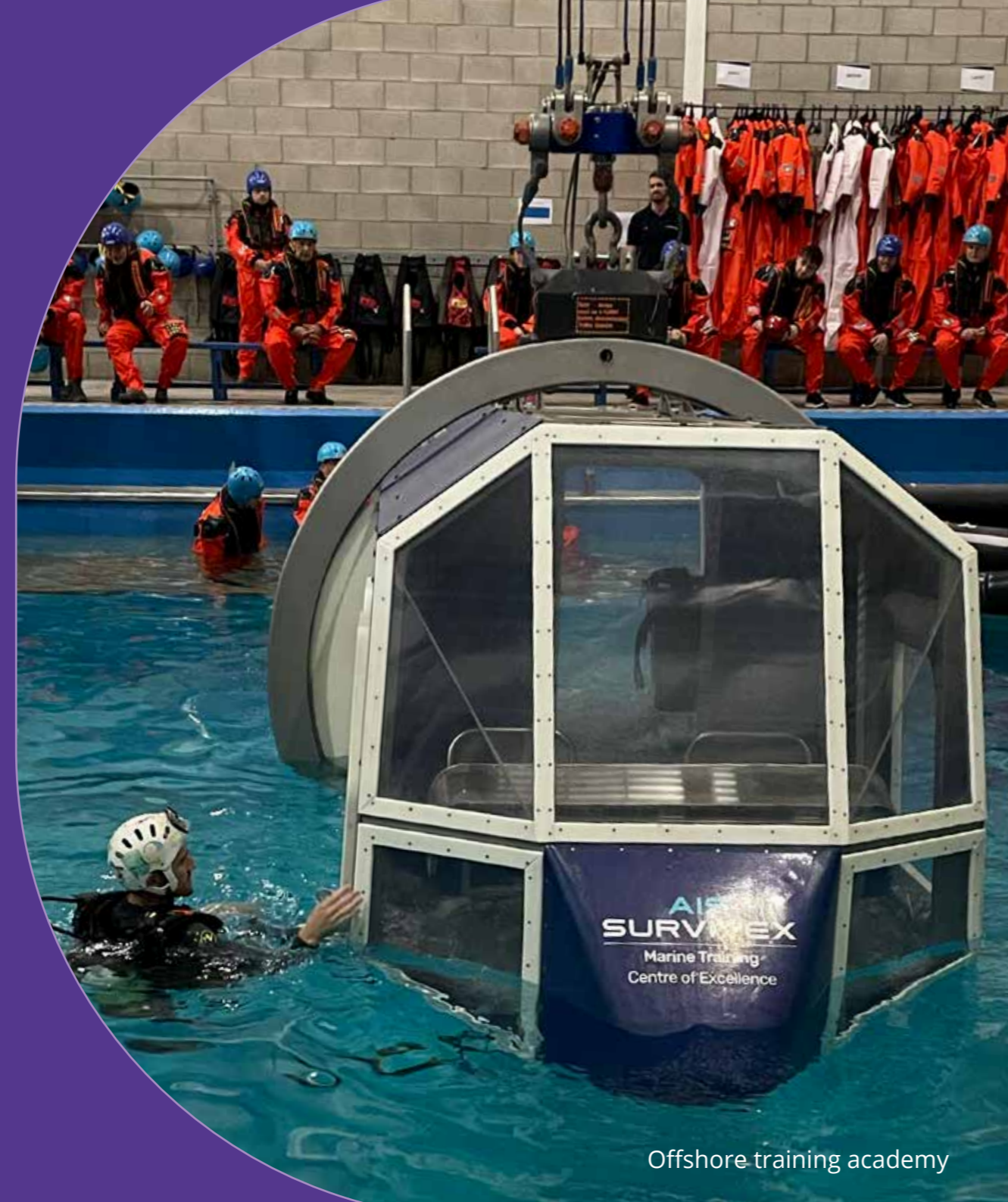
Offshore training academy