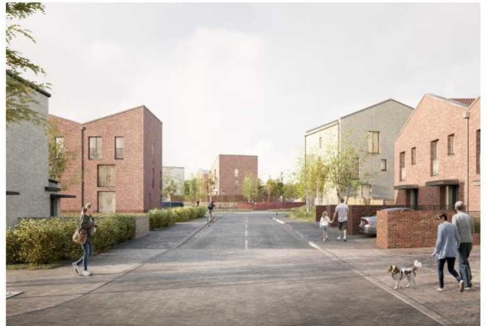
View of central park from the south