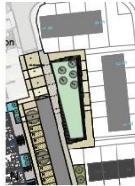
Pocket park, Phase 2