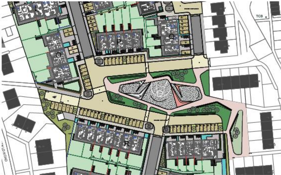
Central park area, Phase 2