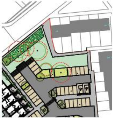
Landscaped areas on Hillend Road, Phase 1

Phases 1 and 2 of the Fraser Avenue masterplan include provision for a large park at the centre of the site as well as a number of smaller 'pocket' parks. These parks can be used to provide play space for children as well as recreation and seating for people of all ages. The design detail and use will be determined through consultation with the local community with final proposals being subject to funding availability.