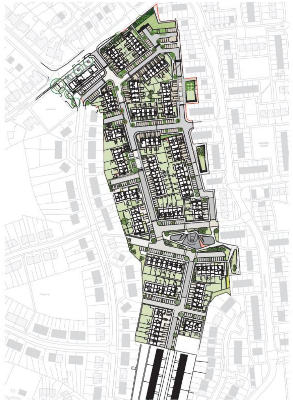
Site plan showing Phases 1 and 2