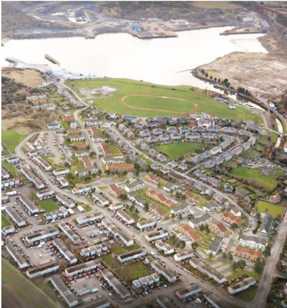
Aerial view of the proposed Fraser Avenue masterplan

It is proposed that artwork is incorporated throughout the development by tracking the route of the Halbeath Railway that once ran across the site, using specially adapted surfaces and lettering. The intention is to create a context specific piece of art to commemorate the history of the local area.