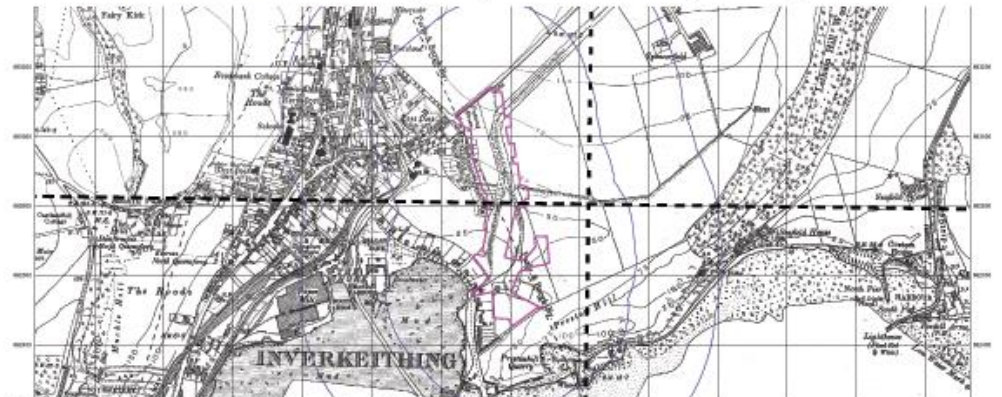
1928 map of Inverkeithing showing the route of the former Halbeath railway through the Fraser Avenue site.