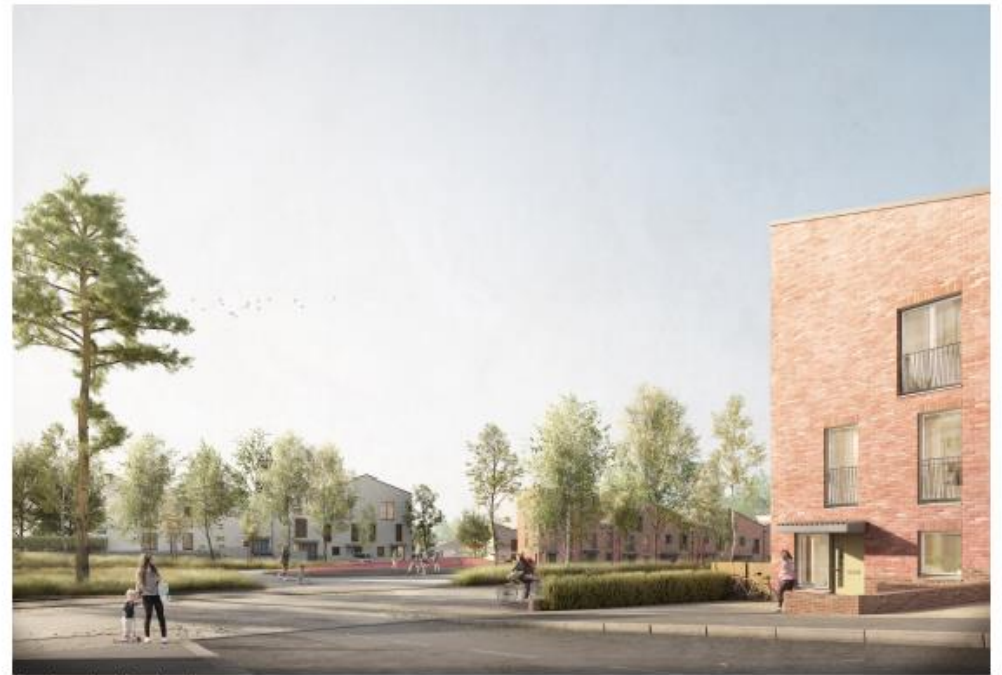
View of central park from the north